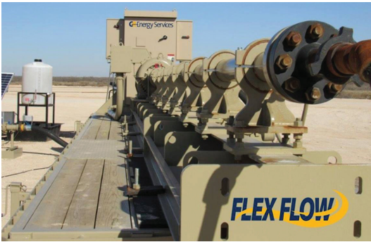
Horizontal pumping system

The GR Energy Services Flex Flow* system combines a unique horizontal pumping system (HPS) with a versatile hydraulic jet pump (HJP) that together provide many advantages over conventional lift systems: