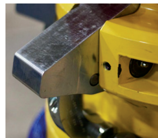
Six hydraulic-actuated cams seal the connection remotely, saving the time required to position personnel at the wellhead.