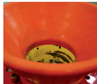
An oversized, highly visible entry guide ensures proper equipment placement.