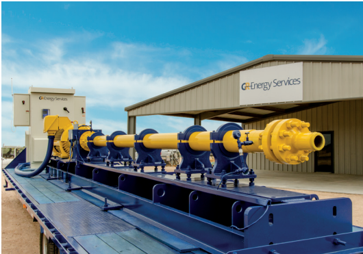
Horizontal pumping system

The GR Energy Services Flex Flow* system combines a unique horizontal pumping system (HPS) with a versatile hydraulic jet pump (HJP) that together provide many advantages over conventional lift systems: